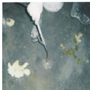
Crack Injection Using Electric Pump