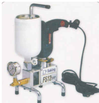
(PU Injection Pump)