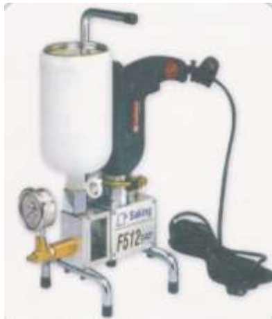
(PU Injection Pump)