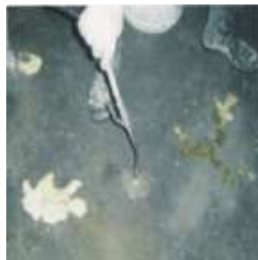
Crack Injection using Electric Pump